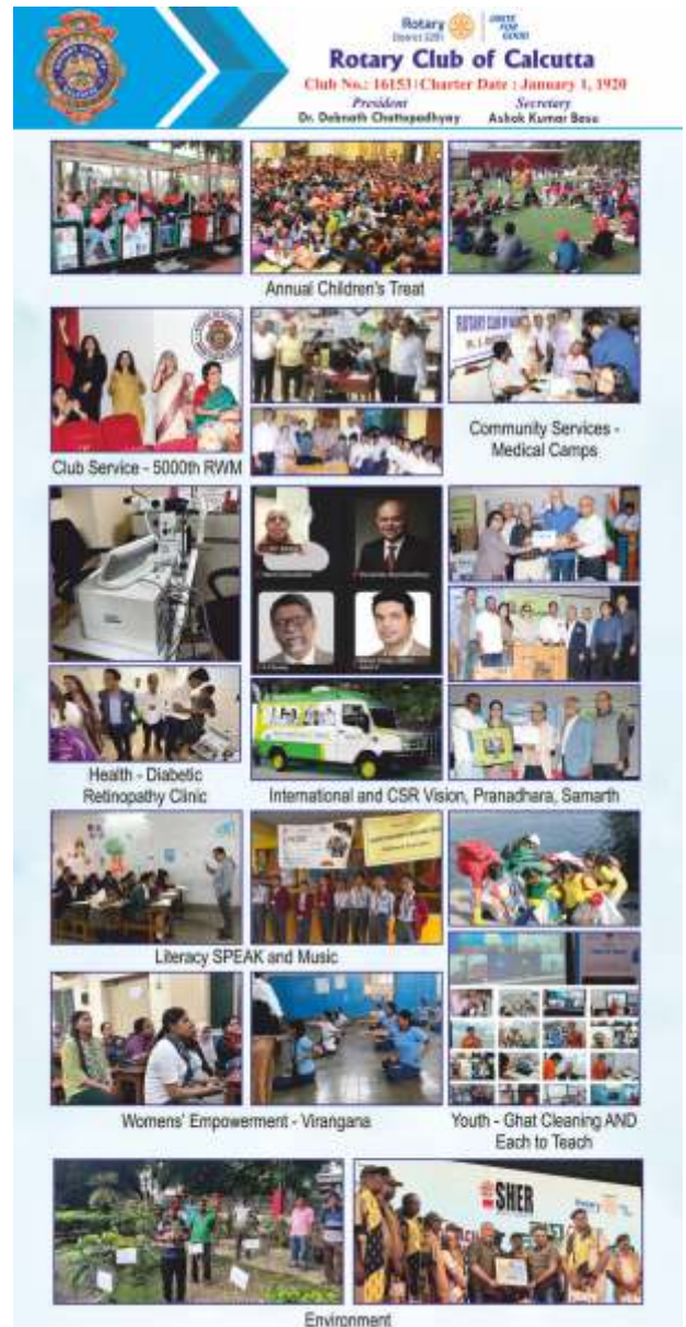
EXHIBIT POSTER AT DISTRICT CONFERENCE

All Members are requested to kindly attend with your families on that day.